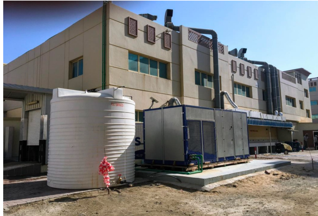
AWA 250 on site